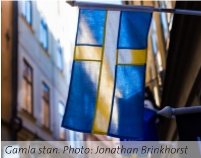
Gamla stan.