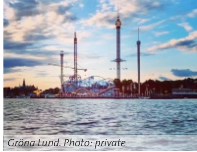
Gröna Lund.