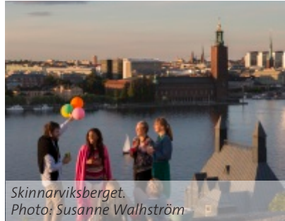
Skinnarviksberget.