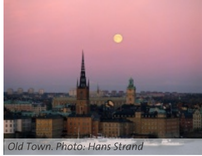
Old Town.