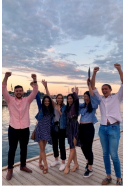
Summer students 2019.