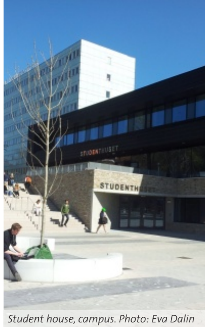
Student house, campus.