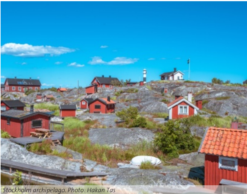
Stockholm archipelago.