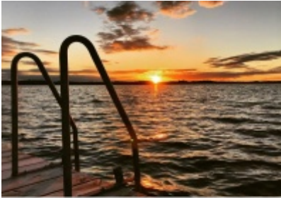
Summer in Stockholm.