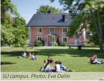
SU campus.