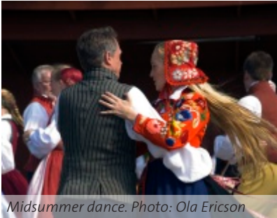
Midsummer dance.